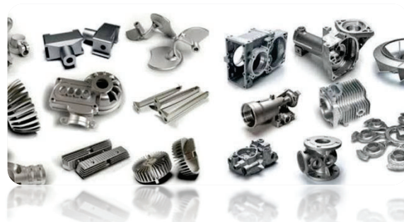
Aluminium Die casting Parts