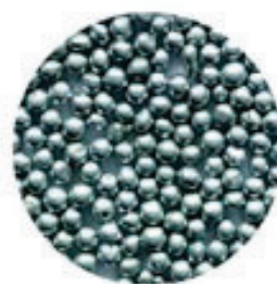
Cast Zinc Shot