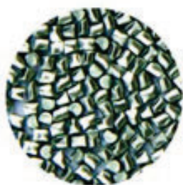
Zinc Cut Wire